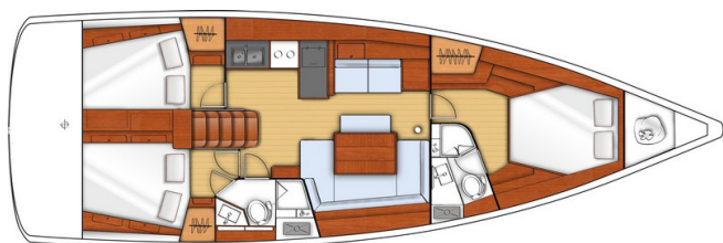
3 cabins - 2 heads